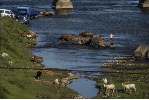
07_ People wash cars and collect gravel at a riverbank on the road between Ulim Waterfalls and Hamhung in the country's east.