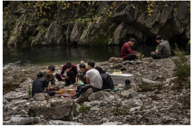
08_ People have a picnic near the Ulim Waterfalls, named after the Korean word for echo, as its rumbling sound resonates across a four-kilometre radius.