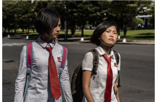
10_ School girls. Pyongyang.