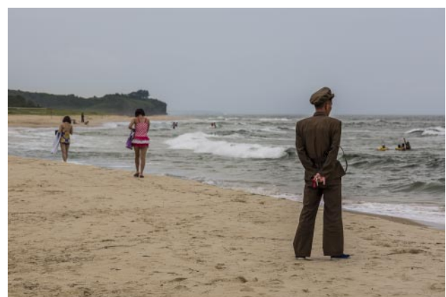
06_ Man in military uniform watches over beachgoers near Wonsan.