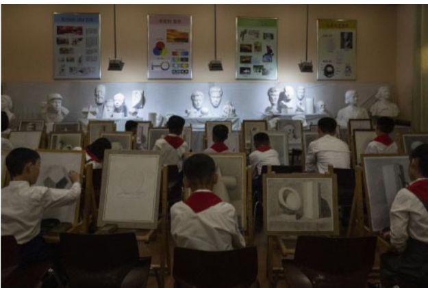
11_ Drawing class at the Mangyongdae Schoolchildren's Palace in Pyongyang, the largest facility for children's after-school activities in North Korea.