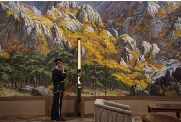
03_ A porter and a woman in the Kumgangsan Hotel at Mt Kumgang, This hotel is known for hosting reunion meetings between families from North and South Korea.