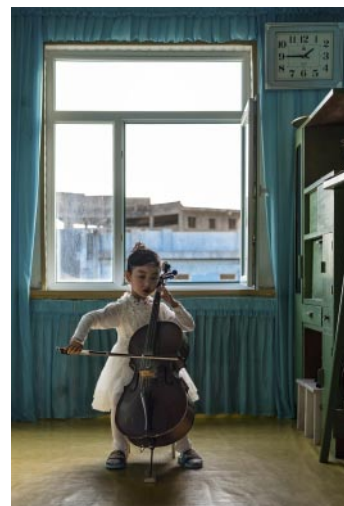
12_ Girl plays a cello at Chongam Kindergarten, Chongjin.